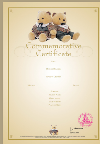
Code: Teddy Bears

There are four designs of certificates available for you to choose from. There is no charge for these certificates.